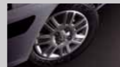
Full Wheel Cover