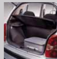
Rear Parcel Tray