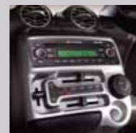
Audio with AUX and USB