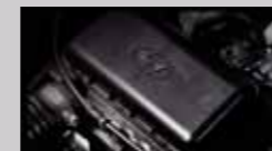
1.1 L Petrol Engine