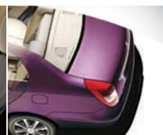
REVERSE PARKING SENSORS