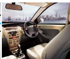
RICH EBONY BLACK INTERIORS WITH LEATHER FEEL SEATS