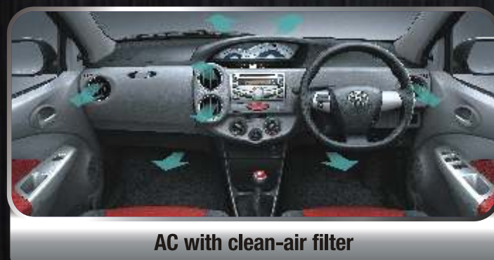
AC with clean-air filter

The refined 1.4 litre D-4D Common Rail Diesel Engine with intercooler offers an ideal combination of excellent driving performance and unparalleled mileage.