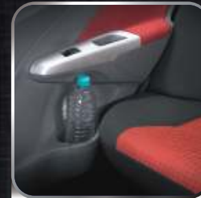
Storage space / Bottle holders

An exclusive feature offering seven 1 litre bottle holders within easy reach.