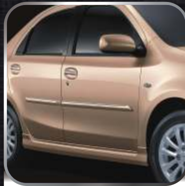
Distinctive character lines

The sculpted lines that run along the side of the car enhance its visual appeal.