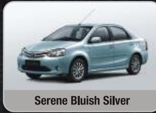
Serene Bluish Silver