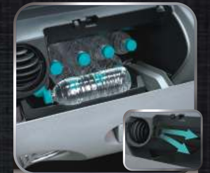
Cooled glove box

A well thought out flat type rear floor design offers ease of movement for rear seat passengers.