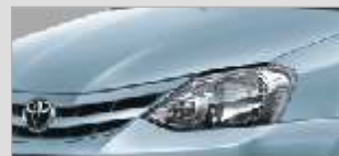
SERENE BLUISH SILVER